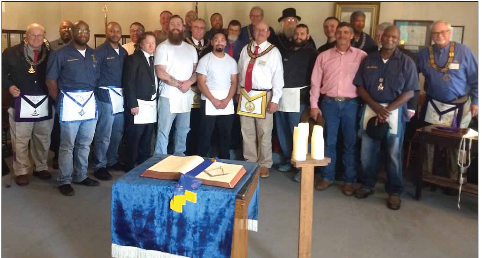
Six New Master Masons were Raised at Historic Yellowstone Lodge No. 88 on October 5th 2019. Three District 9 Lodges were represented as well as Brothers from Acacia Lodge 13 of the Prince Hall Grand Lodge, the Grand Lodge of North Dakota and Kem Temple.