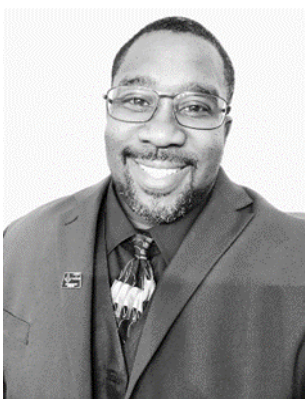
Monyatta Watford Mount Moriah Lodge No. 51 Williston ND

6:30 p.m. - Grand Master Elect Banquet - Baymont Inn